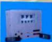
Mot. Vision Drum