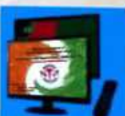
LED Smart Chart

Note: Both MOU-2000 and MOU-2001, are available as REVERSE MODEL (Doctor's Left unit) only against special request and order.